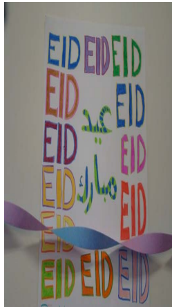
Kids Eid Artwork